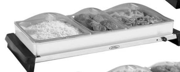
Models NBS-3SLP & NBSP-3SLP